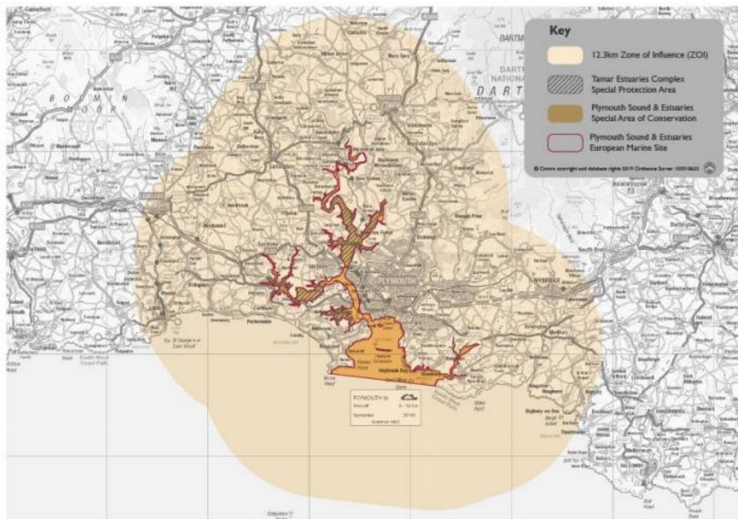
Figure 1: Plymouth Sound and Estuaries European Marine Site